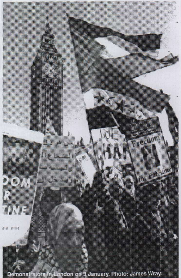
Demonstrators in London on 3 January.

In Paris more than 25,000 demonstrators marched through the city centre chanting "Israel murderer!" and waving banners demanding an end to the attacks. As the demonstration ended there were clashes between groups of protesters and the police and cars were overturned and set alight. In addition 8,000 people demonstrated in Lyon, 3,000 people Nice and