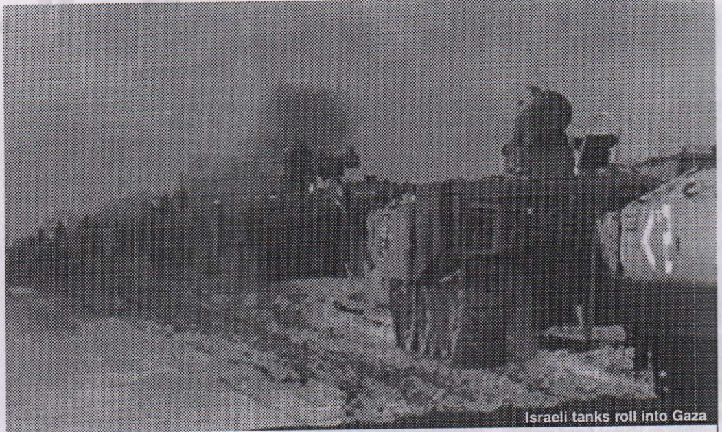
Israeli tanks roll into Gaza

The anti-Zionist forces in Israeli working class must come to the defence of the Palestinians and protest against the war, including organising strikes to disrupt the